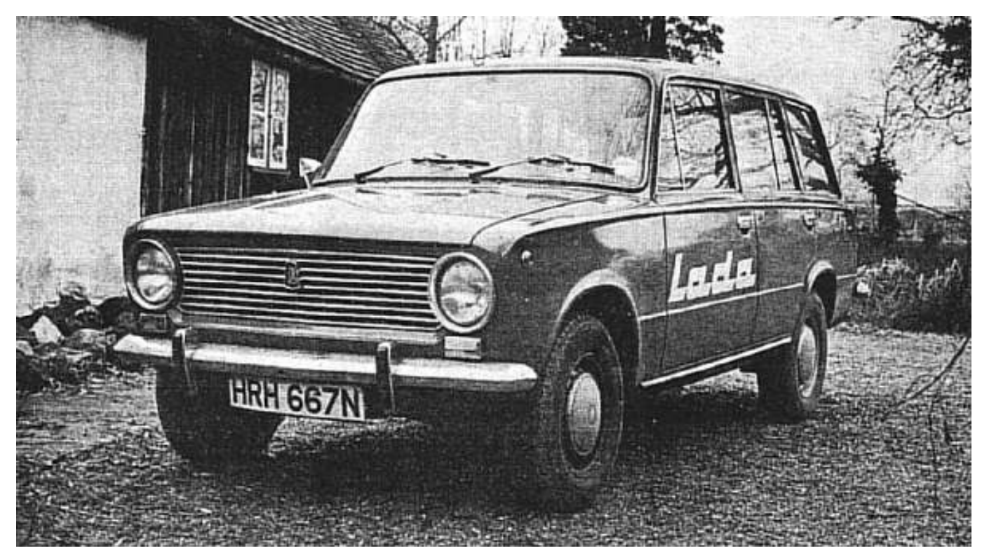
Along with the suspension the Fiat 124 based shell is considerably strengthened