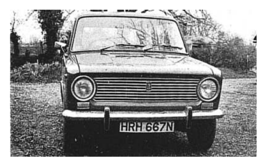
The engine has been substantially altered. Accessibility remains excellent